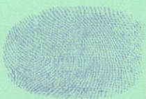
Left Thumb Impression

Name: _____ Title: _____ CNIC # _____ Date: _____